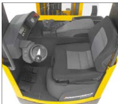
Ergonomic operator cab